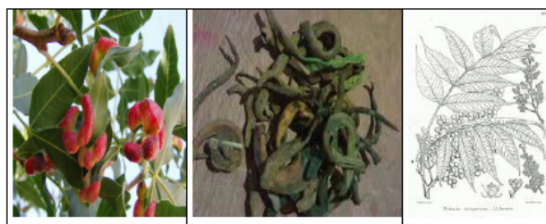
Fig. 2: Pistacia Integerrima : Leaves and galls

Pistacia integerrima is placed in ayurvedic anticancer plant medicines (Aggarwal et al. , 2006). Fractionated stem extract of Pistacia integerrima has proved cytotoxic against breast cancer cell line MCF-7 (Bibi, 2011). Bark extract of Pistacia integerrima and its solvent based fractions were also subjected to phytotoxic studies and ethyl acetate fraction inhibited Lemna minor significantly (90%) followed by chloroform and methanol fraction suggesting their phytotoxic composition (Shafiq ur Rehman et al. , 2011). Galls of Pistacia integerrima were reported to have significant analgesic and anti-inflammatory activity (Ansari and Ali, 1996). Galls were found more potent than leaves as far as analgesic and anti-inflammatory activities were concerned however no acute toxicity was found in oral administration of extracts (Ahmad et al. , 2010). Galls of Pistacia integerrima were also known to lower uric acid content in mice in a dose dependent manner (Ahmad et al. , 2006). Aqueous extract of Pistacia integerrima was found effective in the treatment of hepatic injury in CCl 4 treated rats (Khan et al. , 2004). Pistacia integerrima galls and leaves extracts have proved anti-nociceptive and analgesic on mice with no apparent acute toxicity on oral administration (Ahmad et al. , 2010). Bark extract of plant has also proved to have analgesic and anti gastrointestinal motility effect (Ismail et al. , 2012).