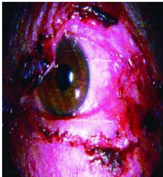
Fig. 1: Full thickness eyelid defect of the upper 175 eyelid induced by human biting in the left eye.

5 minutes resulted in 25mm of wetting in right eye and 8mm in his left eye. BUT testing resulted in 11seconds in right eye and 5 seconds in left eye. Topical artificial tears was applied for him. His dry eye symptom thus release. There is no symptoms of trichiasis, canthal dystopia and lagophthalmos. No more plastic surgery operations were needed (fig. 2).