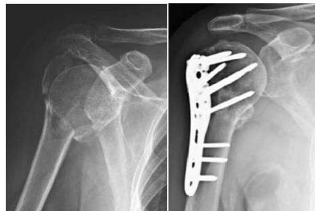
Fig. 4: One case fixed effect comparison of the patient before and after treatment (Note: fixed effect before treatment is shown on the left, fixed effect after treatment is shown on the right).