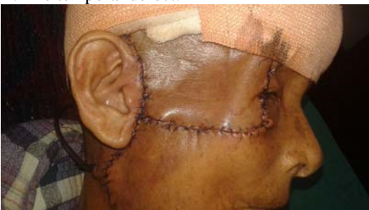
Fig. 3: 2 days after the surgery(lateral view)