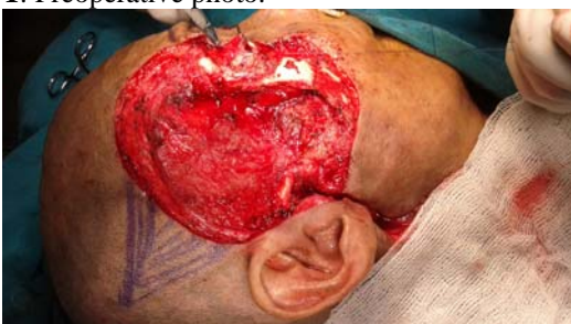
Fig. 2: The temporal defect.