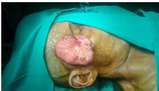
Fig. 1: Preoperative photo.