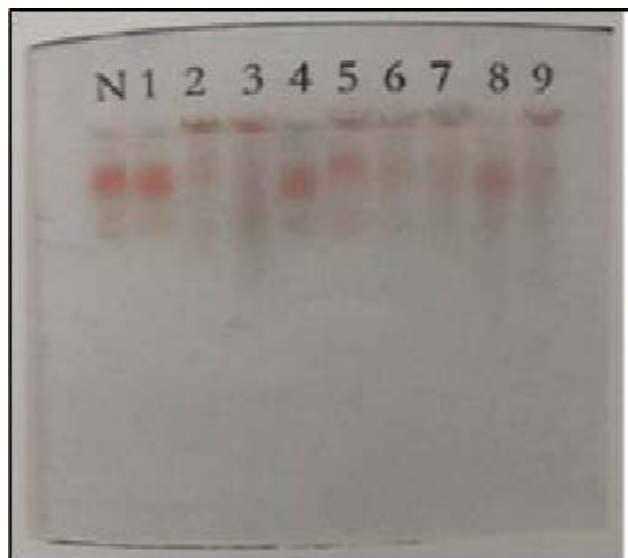
Fig. 2: Agarose gel electrophoresis of plasma lipoproteins of both normal healthy individual (N) and liver cirrhosis subjects (Patients 1 to 9).

both controls and liver cirrhosis subjects (fig. 2). Relative LDL concentration was lowered in the observed band of liver cirrhosis patients than those of the healthy subjects ( p < 0.05 ), i.e. 58.0 \pm 6.31\% and 62.90 \pm 10.8\% respectively. Relative HDL concentration is non-significantly higher in liver cirrhosis patients when compared with controls, i.e. 42.0 \pm 6.3\% and 39.10 \pm 6.6\% respectively.