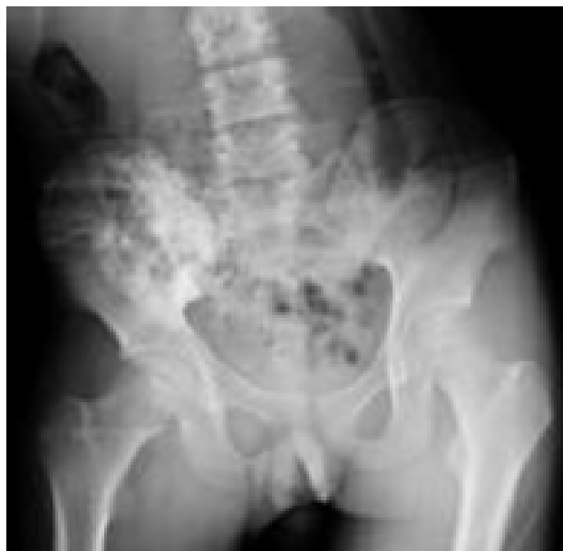
Fig. 1: Bone tumor

sodium chloride was given once a month for consecutive half year.