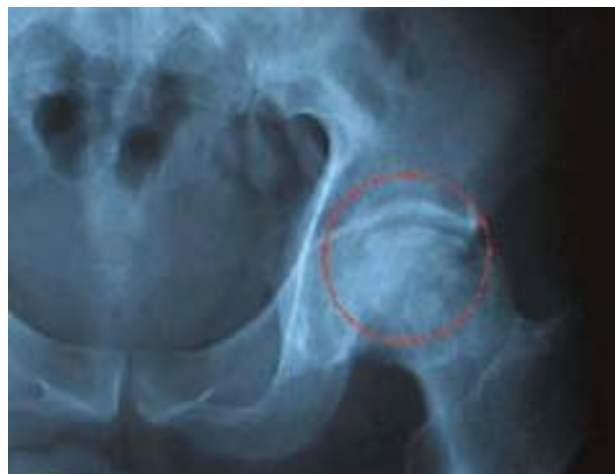
Fig. 3: Pathological fracture

including significant improvement (20 points), improvement (10 points), degradation (under 10 points).