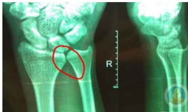
Fig. 2: Skeleton deformity

(2) The treatment method for research group. The research group was given with ibandronate needle therapy (1ml: 1mg). The injection consisting of 500ml of ibandronate needle and 0.9% sodium chloride was given once a month for consecutive half year (Gao et al. , 2017).