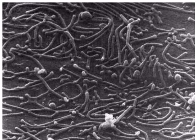
Fig. 1: Mycoplasma pneumoniae.

intravenous injection of erythromycin was implemented (Hunan Kelun Pharmaceutical Co., Ltd., batch number was SFDA approval number: H43020028) with the dosage of 10-25mg. At the first 5 days, this kind of treatment was carried out once a day. On the sixth day, taken oral erythromycin with 10mg-25mg each time for a week in succession and three times a day.