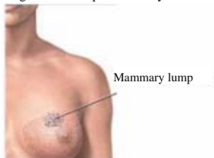
Fig. 1: Mammary lump

21. Study group: 80mg S-1 was applied in patients with body surface area less than 1.25\text{m}^2 , while 100mg was applied in those with body surface area between 1.25\text{m}^2 and 1.5\text{m}^2 and 120 mg was applied in those with body surface area more than 1.5\text{m}^2 . It was administered twice a day, after breakfast and dinner, for 14 consecutive days. Then this regimen was repeated at day 21.