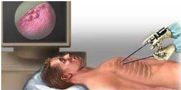
Fig. 2: Pleurodesis