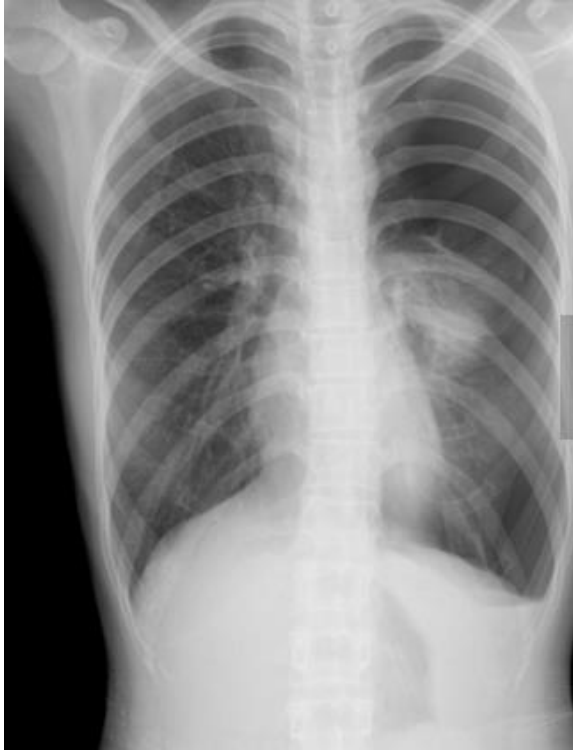
Fig. 1: Spontaneous pneumothorax