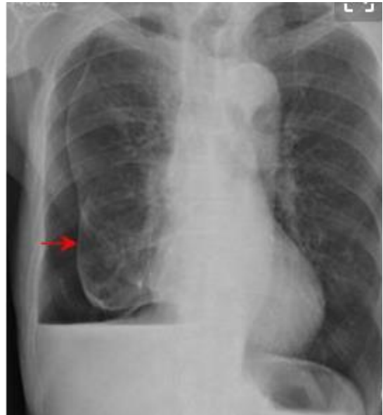
Fig. 3: Spontaneous pneumothorax imaging figure

pleural surface. After that, we connected the drainage tube and checked whether there was gas discharge in the water seal bottle. In case of gas discharge, drainage tube was closed for 2h and connected to the water seal bottle drainage after fully exhausting the gas (Lee et al. , 2018). After surgery, routine treatment was applied. Patients in this study were given follow-up examination of six months to a year.