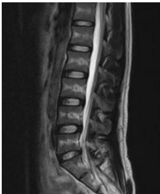
Fig. 3: Examination image after treatment