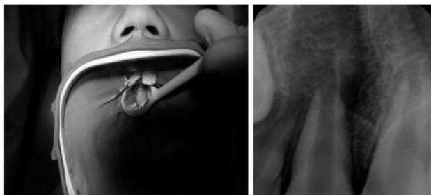
Fig. 1: Preoperative X-ray images of pulp revascularization

locator is preferably controlled within 3 mm. Afterwards, the cavity was sealed using sterile cotton pellet and temporary sealing material.