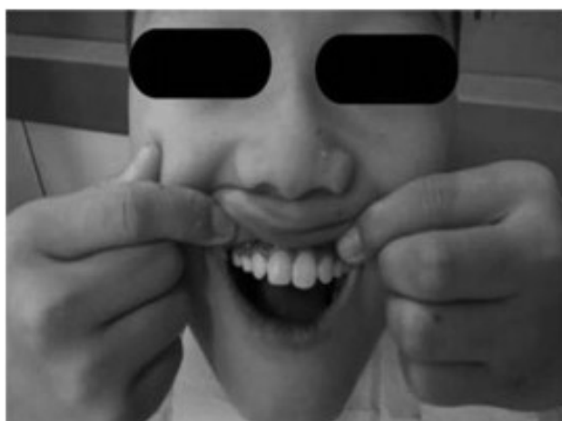
Fig. 2: 18 months after pulp revascularization

The patient will be followed up after 21 days. If the offending tooth has symptoms including percussion pain, pain, fistula, redness and swelling of the gum, repeat the above treatment. If the clinical symptoms disappear and no massive inflammatory exudate is produced in the root canal, thoroughly rinse the root canal, apply sodium hypochlorite solution (2.50%-5.25%) and wash the root canal wall for 3 minutes using 3mL of disodium edetate dihydrate (17%). Finally, rinse the disodium edetate dihydrate in the root canal using sodium chloride solution (0.9%), dry the root canal with sterilized absorbent points. Lightly puncture the apical pulp and tissue with a disinfected large root canal file to make it bleed. When the blood was filled to about 2 mm below the cemento-enamel junction, root canal closure was performed after the blood clot was generated, and the crown was repaired using light cured composite resin.