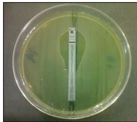
Fig. 2: MIC value of an isolate of MDR Pseudomonas aeruginosa determined by Etest.